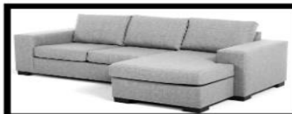
L- SHAPED SOFA