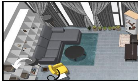
TOP VIEW OF THE LIVING ROOM